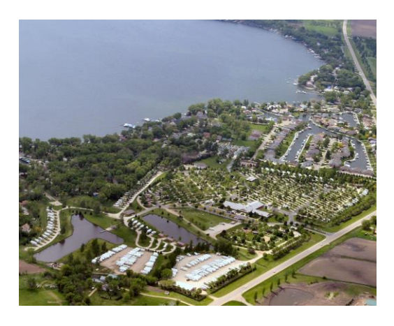
Aerial view of Cutty's Okoboji Resort