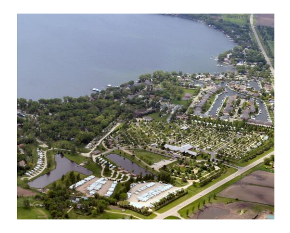
Aerial view of Cutty's Okoboji Resort